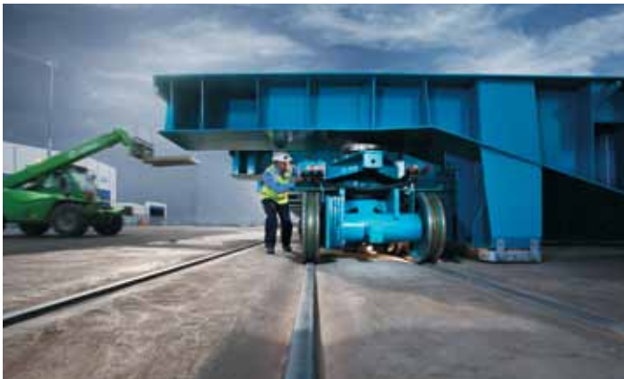
Trestle and bogie

Techport Australia features world-class common user shipbuilding facilities including a wharf, runway, dry berth, transfer system and the largest shiplift in the southern hemisphere.