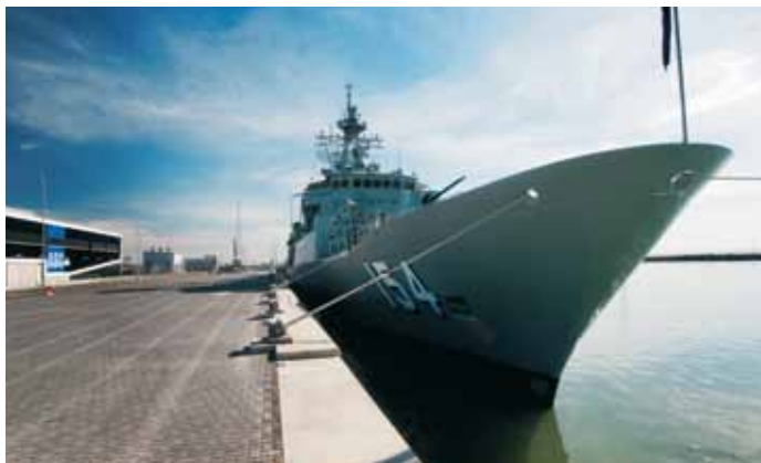
HMAS PARRAMATTA at the Techport Australia wharf

Options exist to construct an additional dry berth to the north of the runway and/or to extend the runway and dry berth across Mersey Road North.