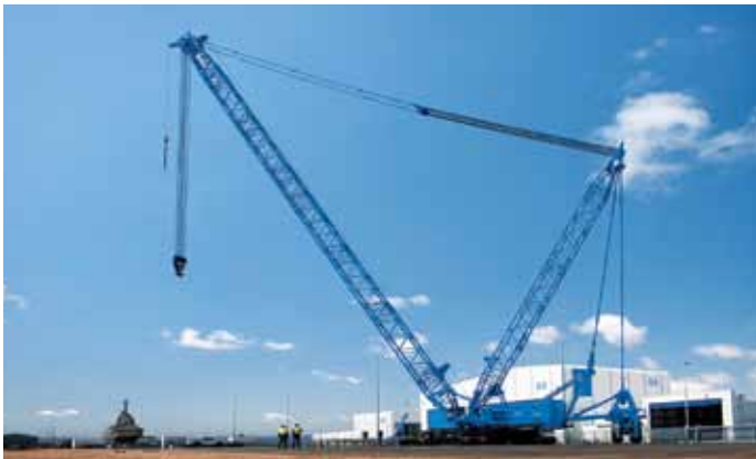
Crane on dry berth

The Common User Facility management system is certified by Lloyd's Register Quality Assurance to AS/NZS ISO 9001:2008 Standard, a clear demonstration of the facility's commitment to delivering the highest service standards for customers.