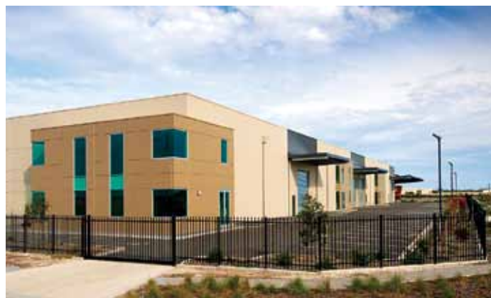
Le Fevre Developments building

A limited number of prime industrial sites remain available in the Supplier Precinct.