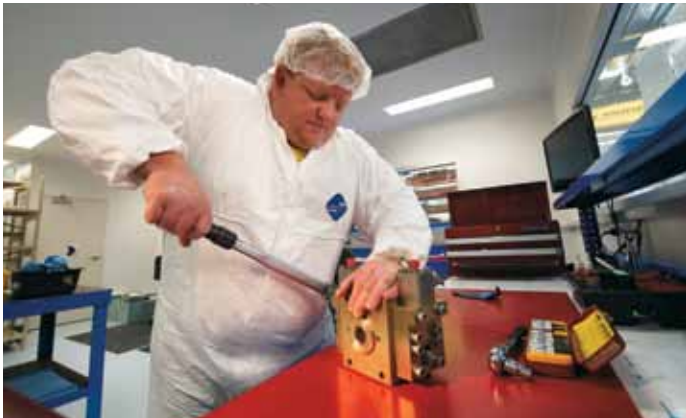
Babcock clean room